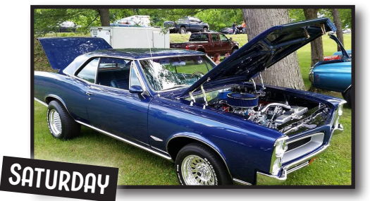
Welcome to our 4th Annual Tigers on the Columbia show! This Western Regional All Pontiac event will recognize 1st & 2nd Place awards in over 26 Pontiac classes.